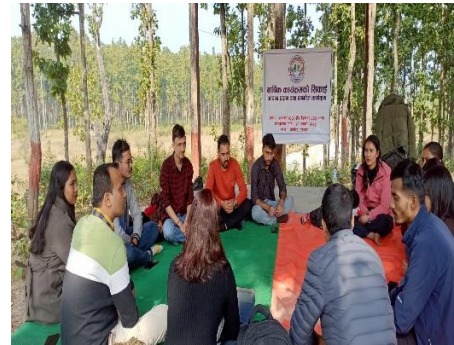
Fig 4- Sharing annual activities