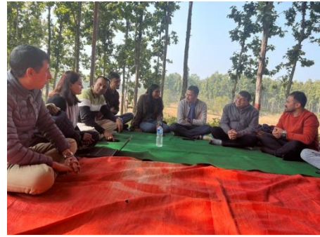
Fig 2: During Meeting