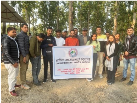
Fig-3 Group Photo after meeting