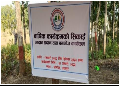
Fig 1: Banner of Program