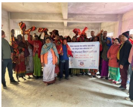
Fig :- 3 Photos taken at the end of the program