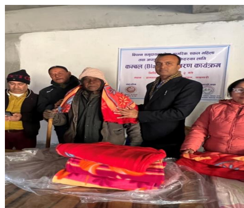
Fig: -2 Blanket distribution