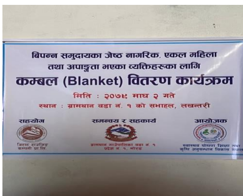
Fig: -1 Banner for Blanket program